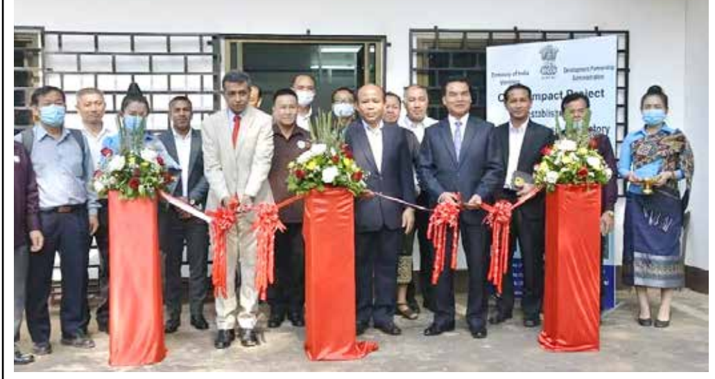
Handing over Ceremony of the Quick Impact Project 'Establishment of Fertilizer Analysis Laboratory' on 12 April 2021.

Minister of Commerce and Industry of India, Mr. Piyush Goyal also attended.