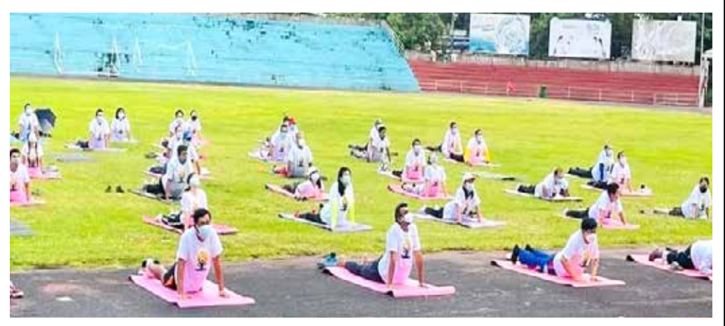
Celebration of International Day of Yoga on 26 June 2021 in Vientiane.

Somhong Irrigation Scheme in Champassak Province – built with Line of Credit from India.