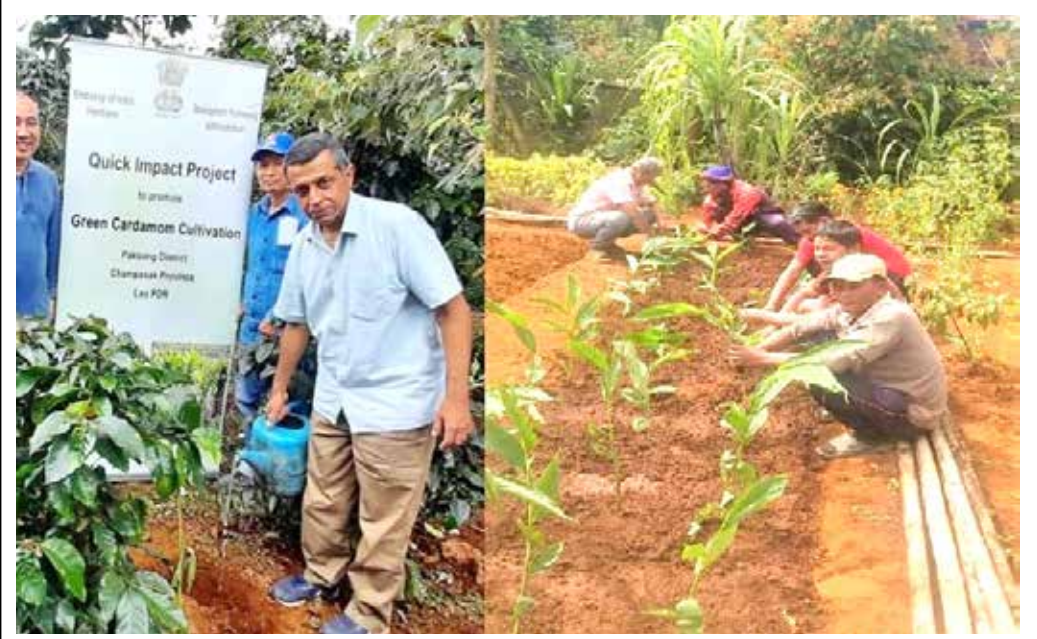
Ambassador of India to Lao PDR Mr. Dinkar Asthana inspecting progress of Quick Impact Project for green cardamom cultivation in Paksong District, Champasak Province (22 August 2020)

'Building Bridges for Constructive Development' was conducted from 3-4 December 2020 in virtual mode which was attended by Industry and Commerce Ministers of India, Cambodia, Lao PDR, Myanmar and Vietnam (CLMV). The then Honourable Minister of Industry and Commerce of Lao PDR, Ms. Khemmani Pholsena emphasized the role of boosting trade and investment in the region to help mitigate the impact of COVID-19 on economies. Honourable