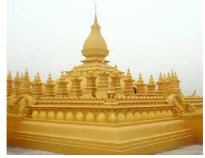
Vat Lao at Bodh Gaya (Buddhagaya) India (Monastery of Laos).